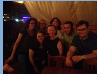
APM Meeting Attendees