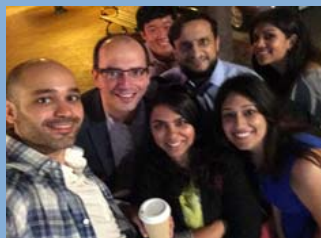
AACAP Meetings Attendees